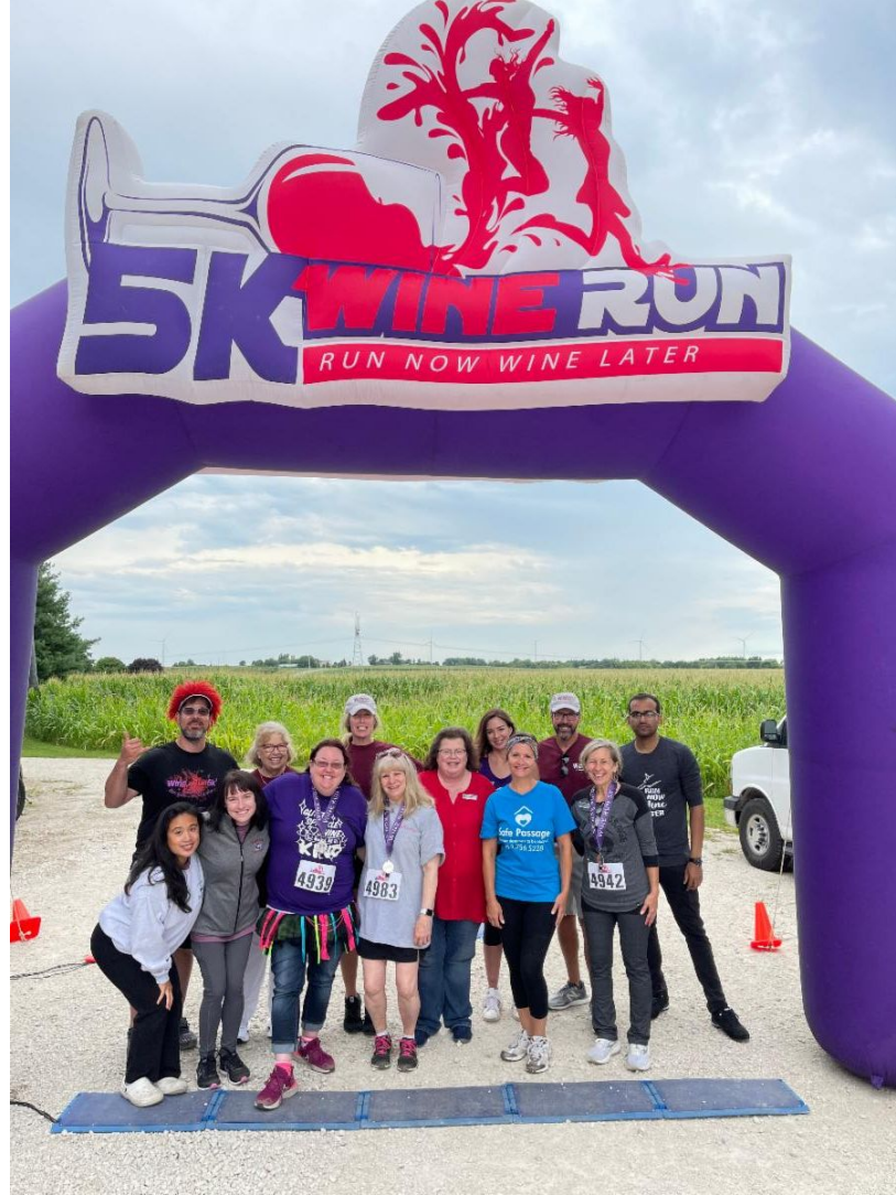
Safe Passage staff and board members smiling alongside our friends from the Waterman Winery 5k.