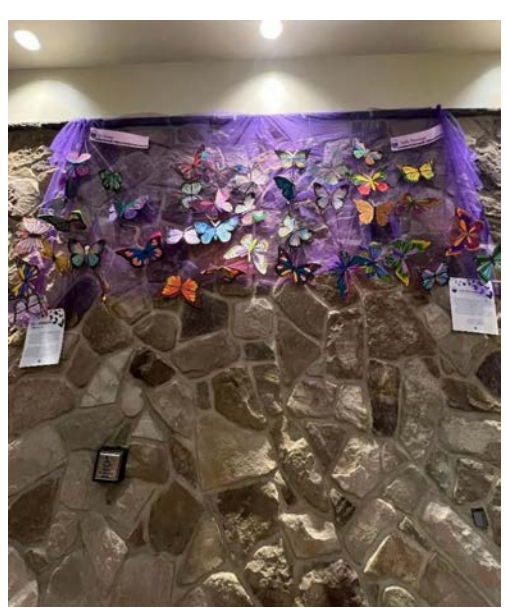
Sandwich Display of client's butterfly artwork