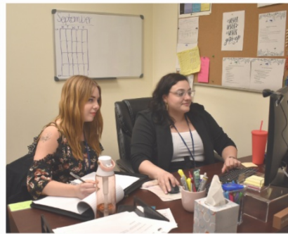
Say hello to our new DV Legal Advocates!