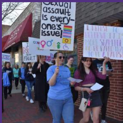
Take Back the Night April 21st

A special thank you to NIU's Division of Academic Diversity, Equity and Inclusion for collaborating with us during Sexual assault Awareness Month! We appreciate the work you do to provoke and inspire change for NIU students.