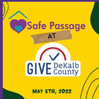
GiveDeKalbCounty May 5th