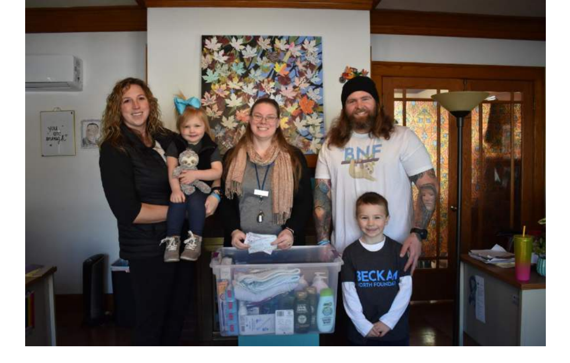
The Beckam North Foundation