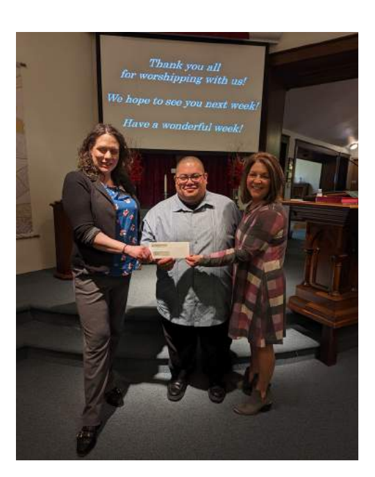
United Methodist Church of Waterman