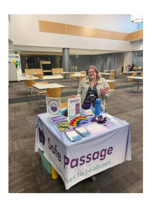
Kishwaukee Community College